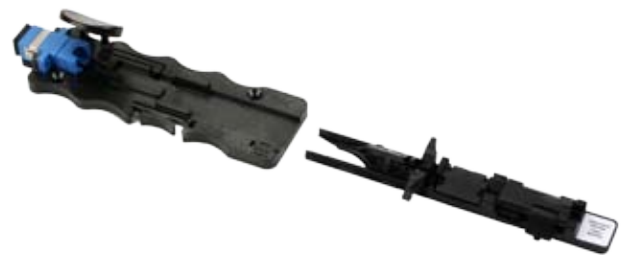
3M™ No Polish Connector Assembly Tool